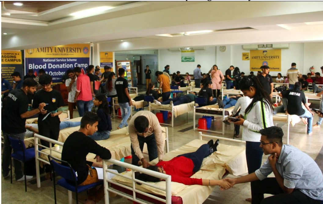
Blood Donation Camp, NSS, AUMP, 3.10.2019