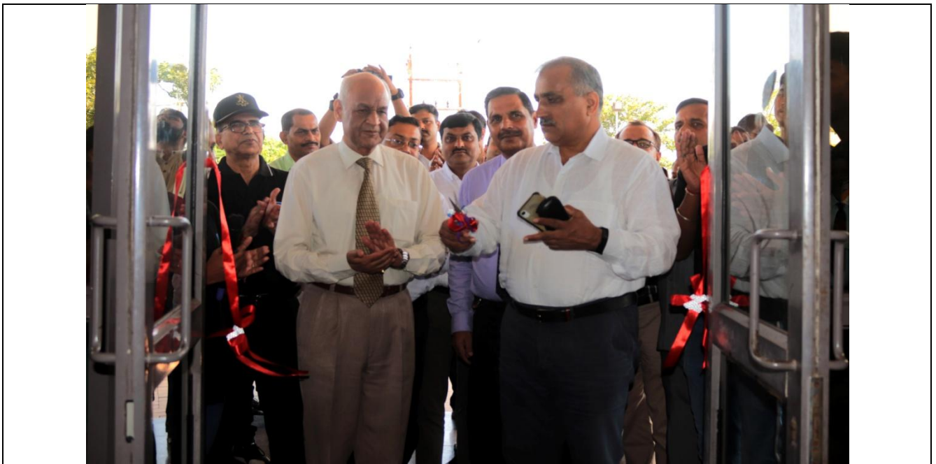
Inauguration of Blood Donation Camp, AUMP, 3.10.2019